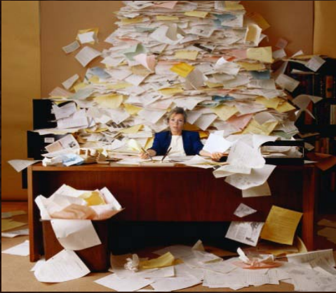
What faculty think I do