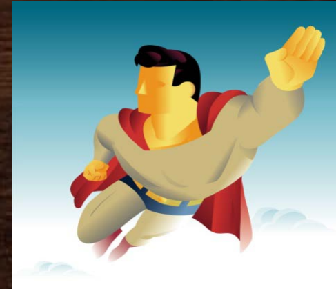
What my boss thinks I do