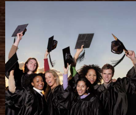
What WE really do