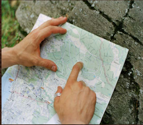
What ACCJC thinks I do