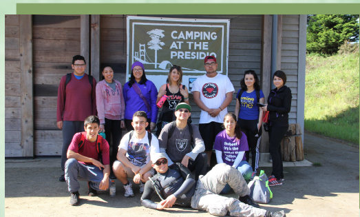
Camping at the Presidio San Francisco, CA

Cultural Activities To help in increase our students cultural awareness. SSS & SSS-ESL sponsors several cultural activities throughout the year. Activities vary from attending plays, camping, visiting historical sites, museums and much more.