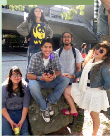
CSU, East Bay Tour