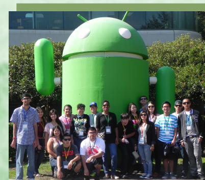
Top: Google Headquarters Bottom: Azteca IV